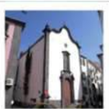
Igreja do Carmo

TIME: In the morning: 9H00 – 10H30 In the afternoon: 16H00 – 18H00